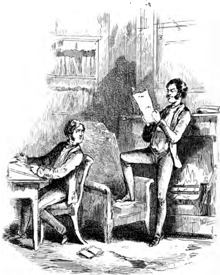
PEN HEARS HIMSELF IN PRINT